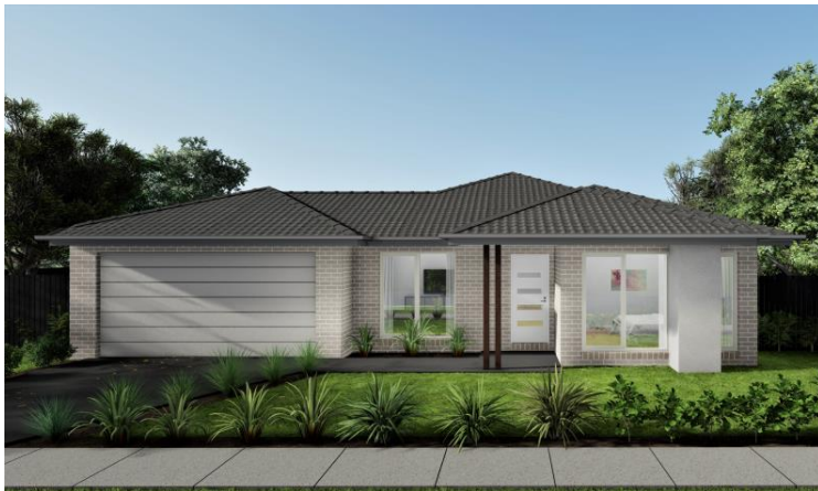
Façade photo shown for illustration purposes only.